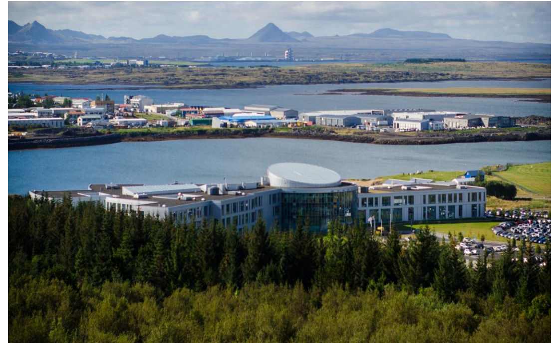
Reykjavík University (31811484225).jpg - Wikimedia Commons